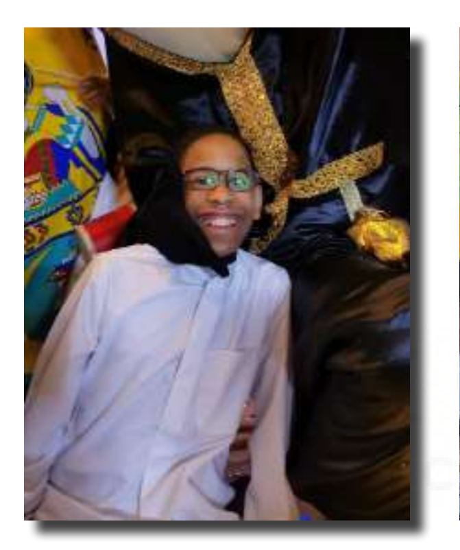
5-Ice Cream Day : What a great idea to welcome summer and end the school year! Students enjoyed decorating their ice cream cones with yummy

4-Guigian Celebration: Students celebrated this day with special Ramadan Characters with whom they sang & danced. They had also taken memorable pictures in the photobooth specially designed for