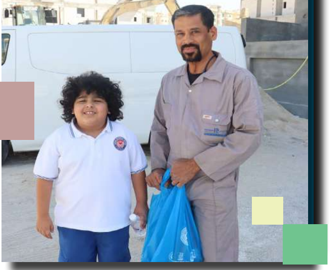
an overwhelming response from the community with efforts made by both students and staff of the schools.