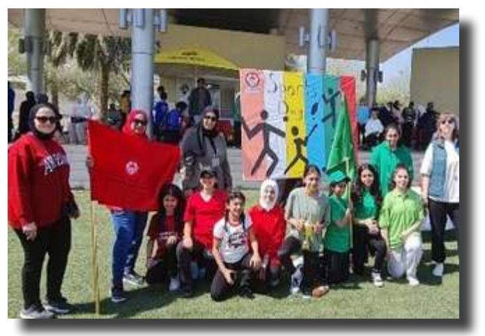
our students to collaborate and learn with students from an international country, deepening cultural and academic ties.