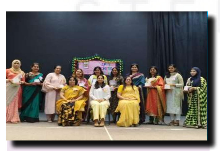
International Women's Day is celebrated every year on March 8th. It is a global occasion that recognizes the remarkable achievements of women, raises awareness, and encourages advocacy for gender equality.

'Feminism isn't about making women strong. Women are already strong. It's about changing the way the world perceives that strength.'